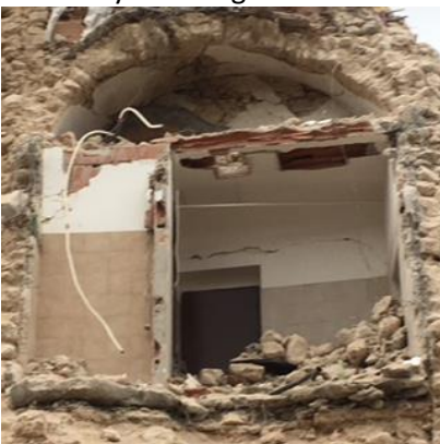
Photo of the 2016 earthquake in Italy

The image of rubbles left by the war or by the earthquakes that shake Italy every few years, has come to our mind; as well as the awareness that what we are dealing with now is an invisible, untouchable, boundaryless danger.